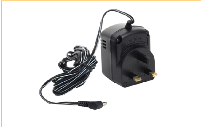
304-005, UK, 230 V, 3-pin Square