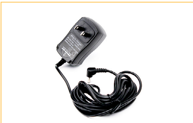
304-006, USA, 110 V / 115 V, 2-pin Flat