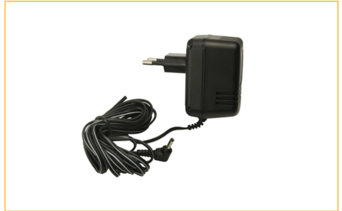
304-004, Europe, 230 V, 2-pin Round