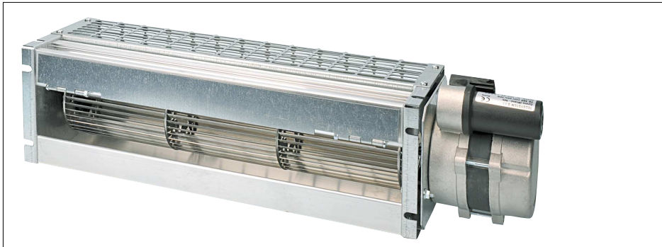
TG 360 FAN