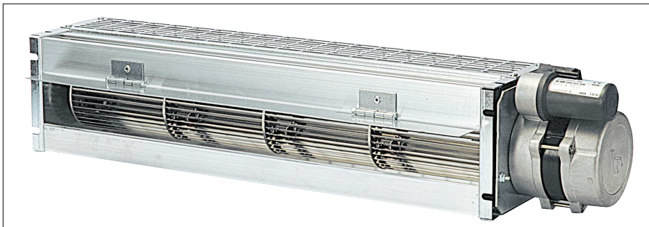
TG 500 FAN