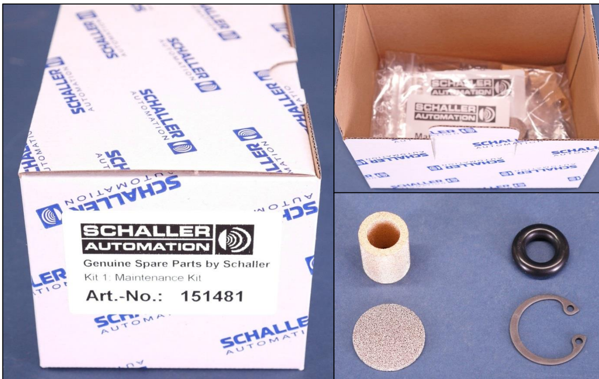
Fig. 1 Item Line Position

*Note: Quantity sufficient for 1 year / 8.000 hours as for Steps 4 + 6 of Maintenance Schedule (plus spare)