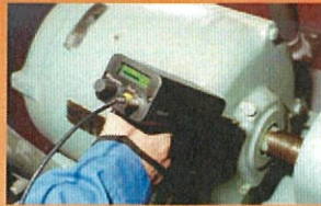
Test bearing condition