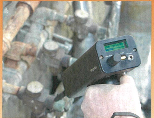
Inspect steam traps