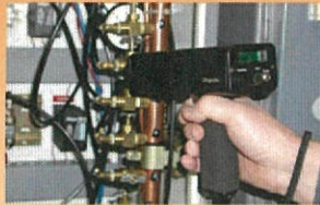
Detect air leaks